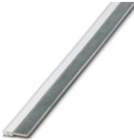
Continuous plug-in bridge, mounting type: Plug-in mounting, Color: gray

Please be informed that the data shown in this PDF Document is generated from our Online Catalog. Please find the complete data in the user's documentation. Our General Terms of Use for Downloads are valid ( http://phoenixcontact.com/download )